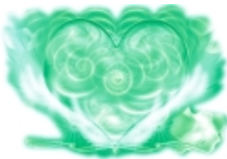
The Emerald Heart